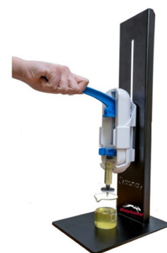
Part No. DDY-004

The Piston provides the downwards movement and is used as the "Press" for the syringe's plunger, the filter or the test tube